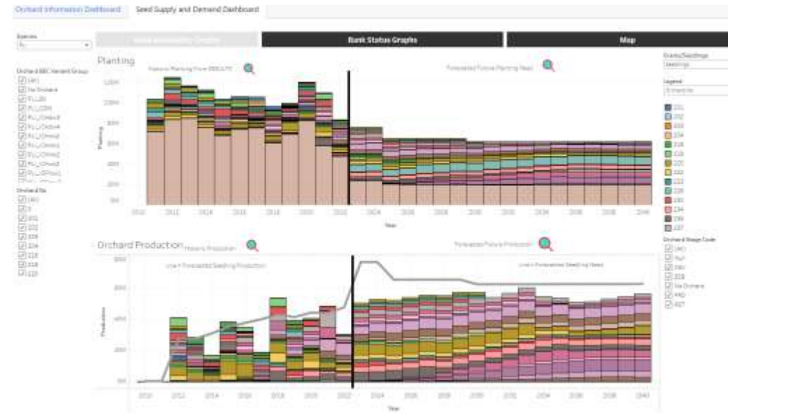
Seed Supply and Demand