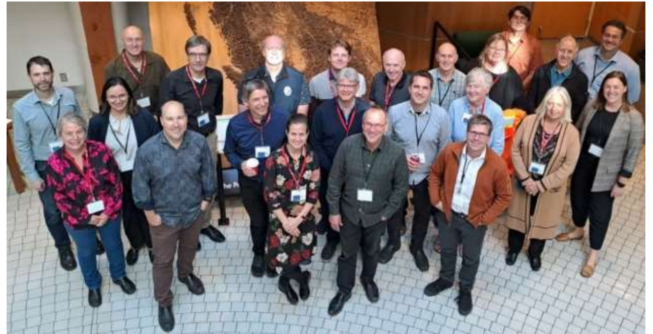
FGC Members and Guests Pacific Forestry Centre October 12, 2023