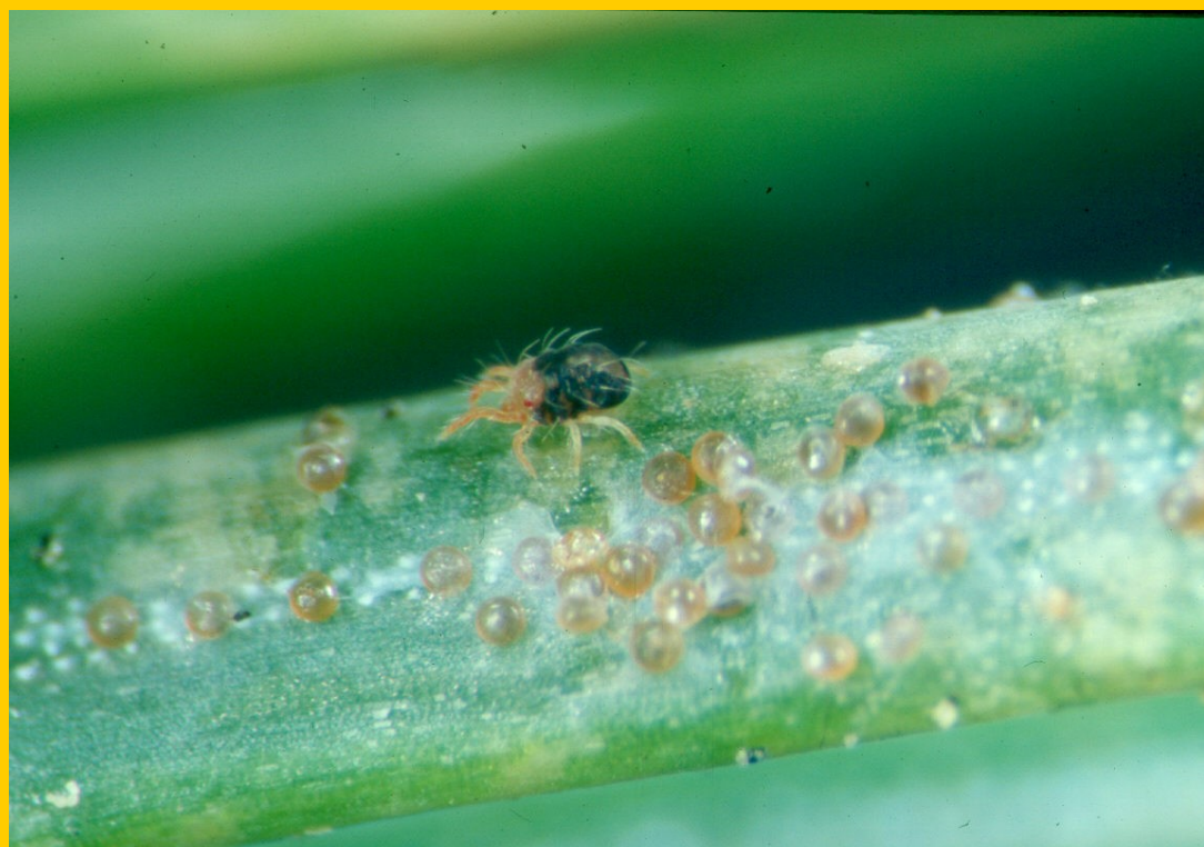
Above: Spruce Spider Mite ( Oligonychus ununguis ) (adult with eggs—W. Strong), can have up to 8 generations per year and populations can grow very quickly