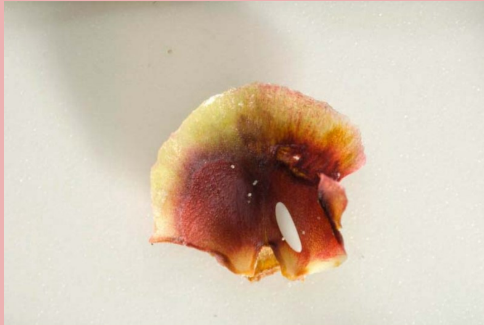
Strobilomyia neanthracina egg on a dissected cone scale (D. Manastyrski)