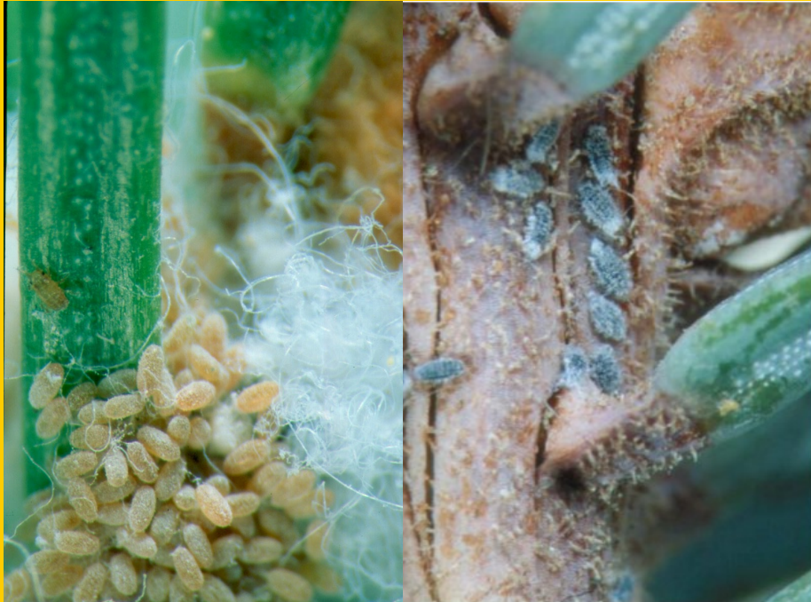
Above: Adelges cooleyi (left) Eggs and Crawlers and (right) nymphs beginning to wool-up