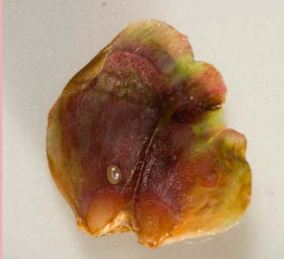
Cydia strobilella egg on a dissected cone scale (D. Manastyrski)