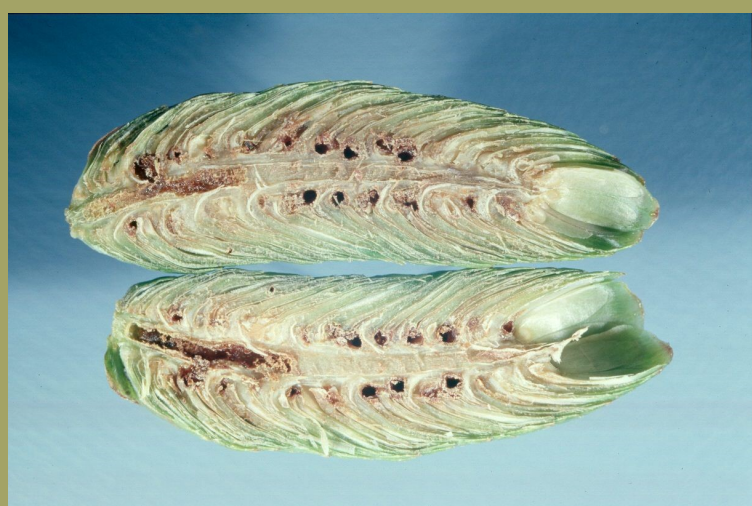
Above: Spruce cone with signs of damage from Strobilomyia (W. Strong)