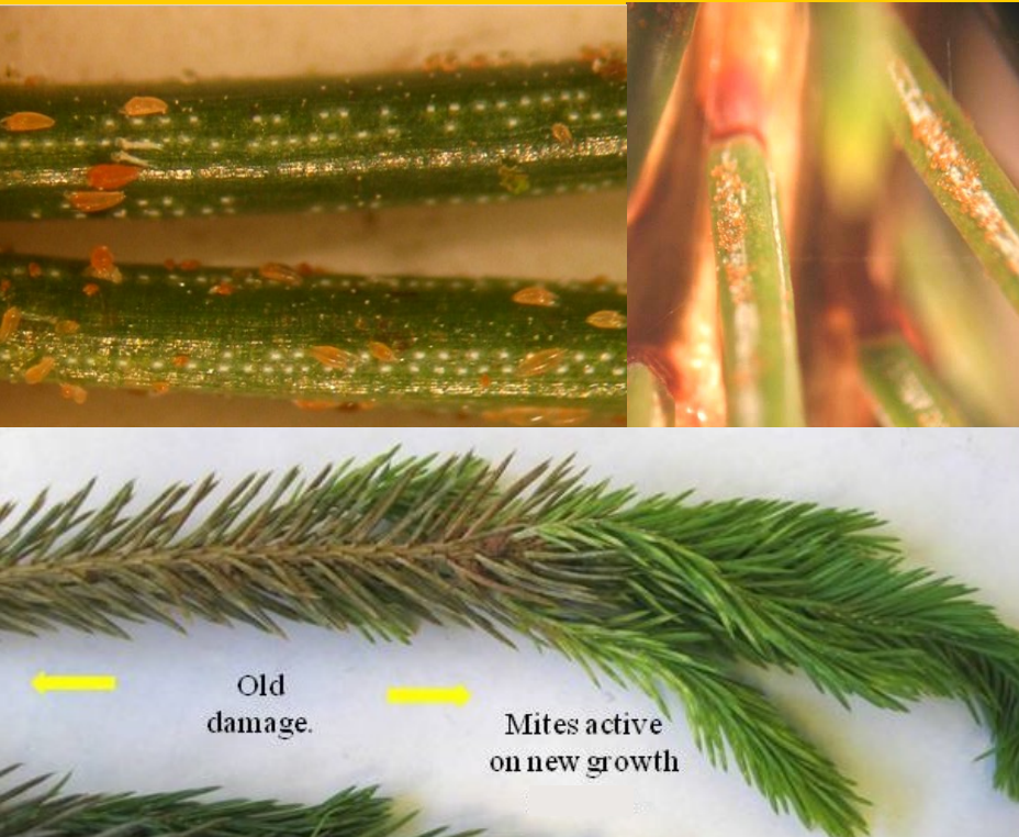
Top: (left) Spruce Rust Mite adults and (right) eggs on spruce needles; Bottom: shoot showing symptoms of rust mite damage (J. Corrigan)