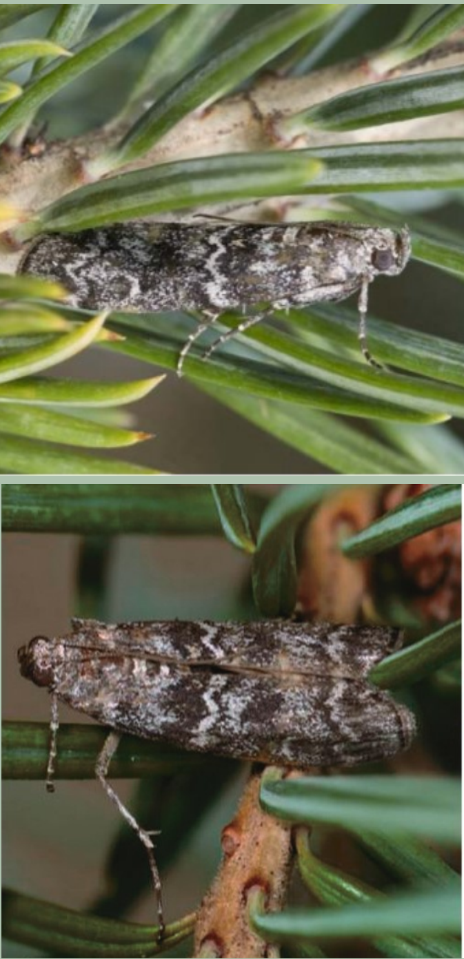
Dioryctria abietivorella adults (W. Strong)