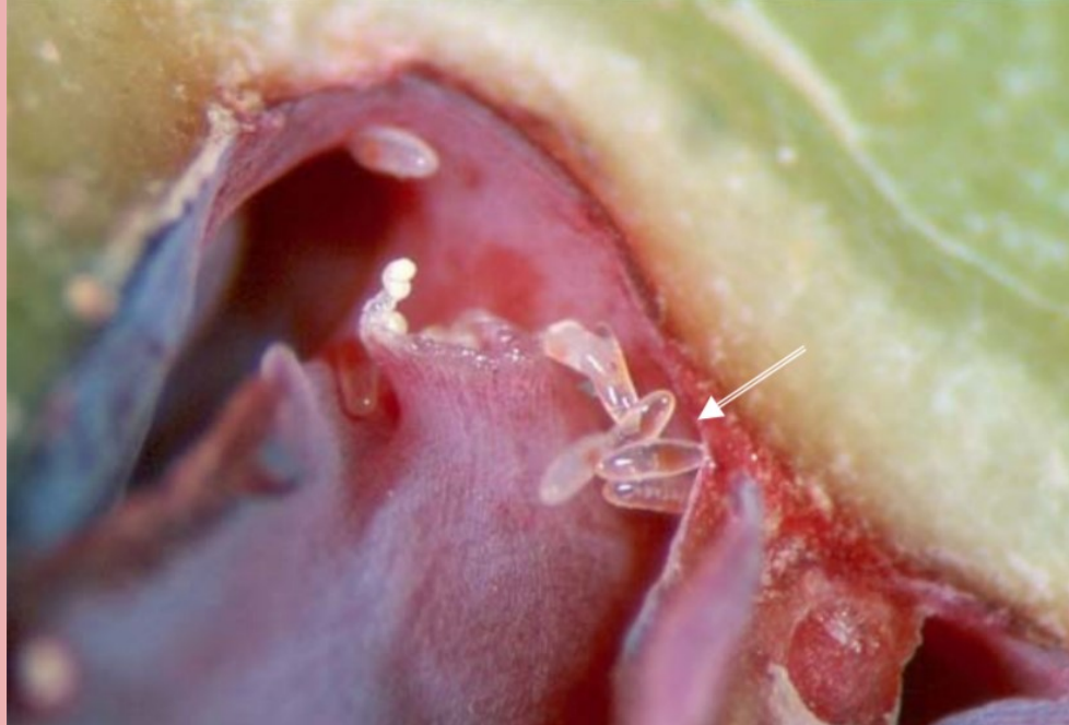
Kaltenbachiola rachiphaga eggs on spruce conelet (W. Strong)