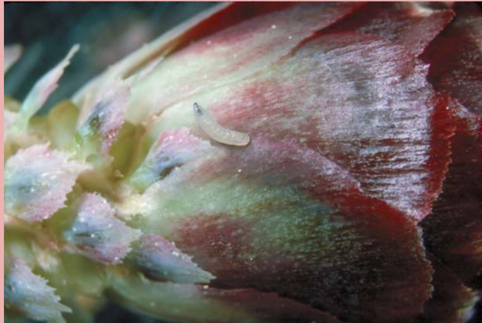
Early instar Strobilomyia neanthracina larva on a spruce cone (W. Strong)