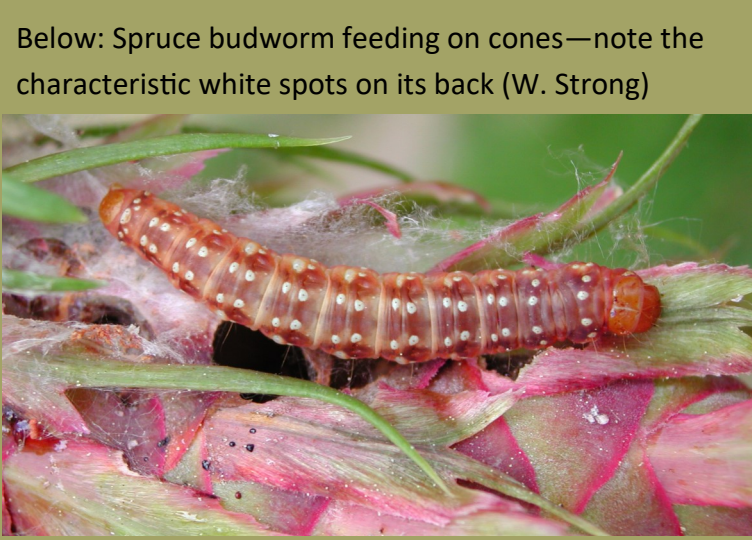
Below: Spruce budworm feeding on cones—note the characteristic white spots on its back

Clockwise from right: Early instar Dioryctria larva; Dioryctria frass and webbing on spruce cone cluster; Early signs of Dioryctria feeding on a cone.