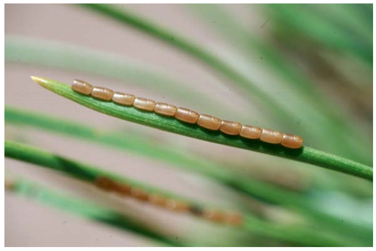
Leptoglossus occidentalis eggs on a pine needle