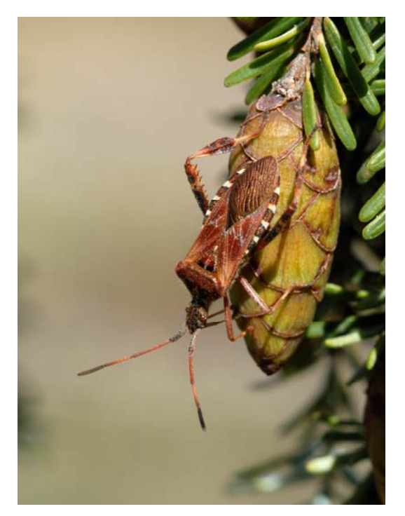
Leptoglossus occidentalis adult on cone (D. Manastyrski)

IMPORTANCE : It is generally felt that large populations can cause severe damage to seed crops, especially in Douglas-fir and pines. Bagging studies in British Columbia have shown lodgepole pine seed losses to seed orchard populations of Leptoglossus can be as high as 83%.