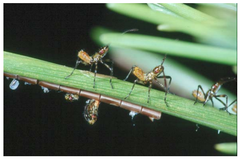
First instar Leptoglossus occidentalis nymphs on conifer needle; hatched and hatching eggs on underside of needle

NYMPH : Similar appearance to the adult, but smaller and wingless. There are five nymphal instars. Generally found on or near cones, and initially feeding on foliage before switching to seeds in cones. Early instars usually found in small aggregations; older individuals are more dispersed. Nymphs mature in about 5 weeks.