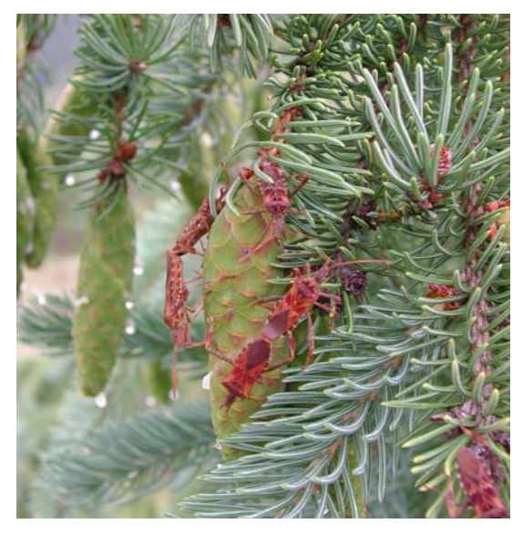
Mating Leptoglossus occidentalis on spruce

Researchers at Simon Fraser University and the British Columbia Ministry of Forests and Range have recently discovered that conifer seed bugs can perceive and are attracted to infrared light wavelengths. A monitoring program utilizing this information is currently under development. University of Northern British Columbia researchers have found a strong clonal preference in seed bug feeding. Knowing preferred clones could improve the efficiency of monitoring and control programs.