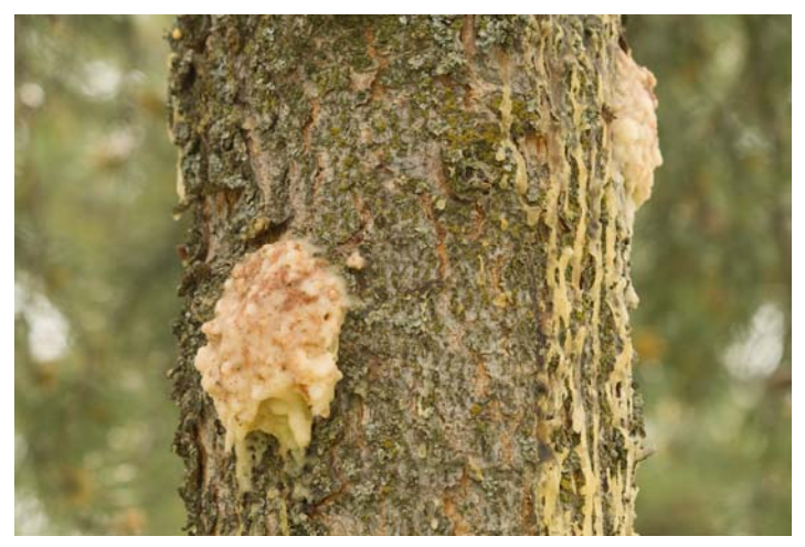
Synanthedon sequoiae pitch masses on a lodgepole pine stem (D. Manastyrski)

Cone and Seed Insect Pest Leaflet No. 13 Sequoia pitch moth (Synanthedon sequoiae) and Douglas-fir pitch moth (Synanthedon novaroensis)